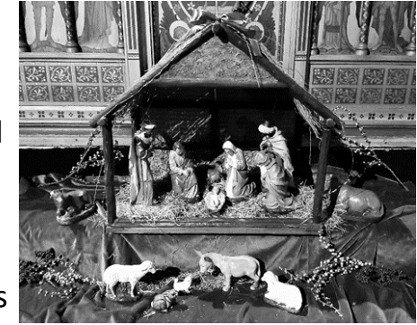
Photo: The Magi

The beginning of a new year is a season of light. On 6 th January the Feast of the Epiphany was celebrated by Christians, the manifestation of Jesus Christ to the nations, represented by the Magi (the 'Wise Men' or 'Three Kings') who bring gifts of gold, frankincense and myrrh.